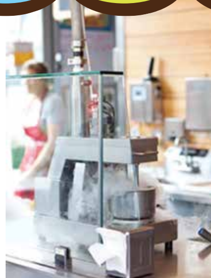
Ice cream shops serving desserts made with liquid nitrogen are unique and very popular.

Note: If you are concerned about the ambiguity of these answers, now you know why ice cream historians are still arguing about the origins of ice cream!